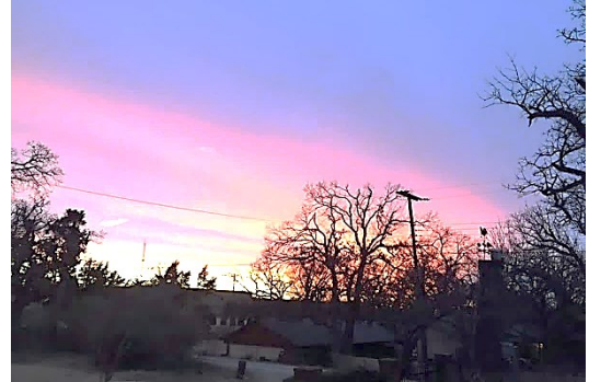
Sunset in OKC

His mercy is everlasting. He is patient with me. He gives me each breath. He designed my heart and keeps it beating, 24/7. He intercedes for me. He sends beautiful people into my life to encourage me. He gives me hope for tomorrow.